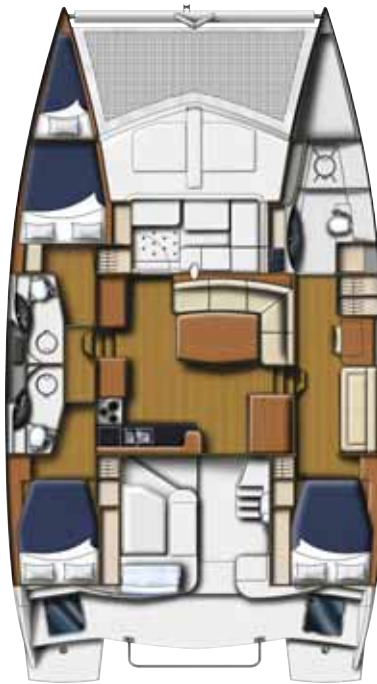
Three cabin layout.

Another bluewater cat is the Antares 44i that has a protected starboard-side helm station near the cockpit like the Leopard, but has a galley-down layout inside that some cooks will not like. All three designs are offshore capable and are delivered to their owners worldwide on their own bottoms.