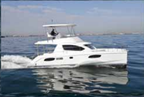
LEOPARD 39 POWERCAT