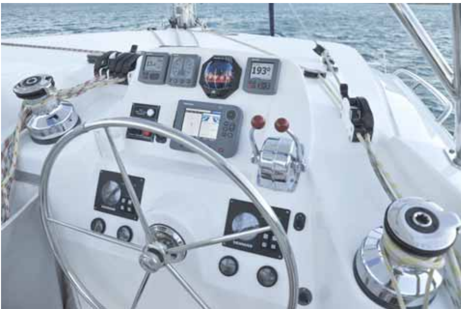
The helm station to starboard has wheel, engine controls, sail controls, and electronics all close at hand.

Other than a few racing catamarans where forward cockpits are mostly used for sail management, cruising cats don't have the unique forward lounge of the Leopard 44, so there are few direct competitors. Therefore, perhaps the best ways to compare would be on performance and offshore capability. By that measure, you might want to consider the Catana 42 that comes standard with all essential cruising equipment. It's a solid, fast boat with the drawback being twin exposed helm stations on the hulls.