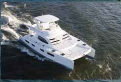
LEOPARD 47 POWERCAT