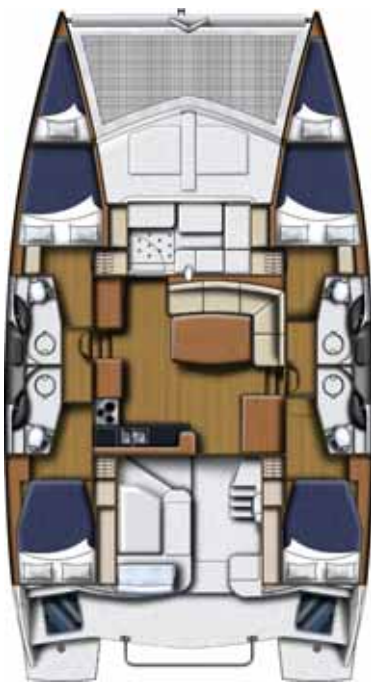
Four cabin layout.