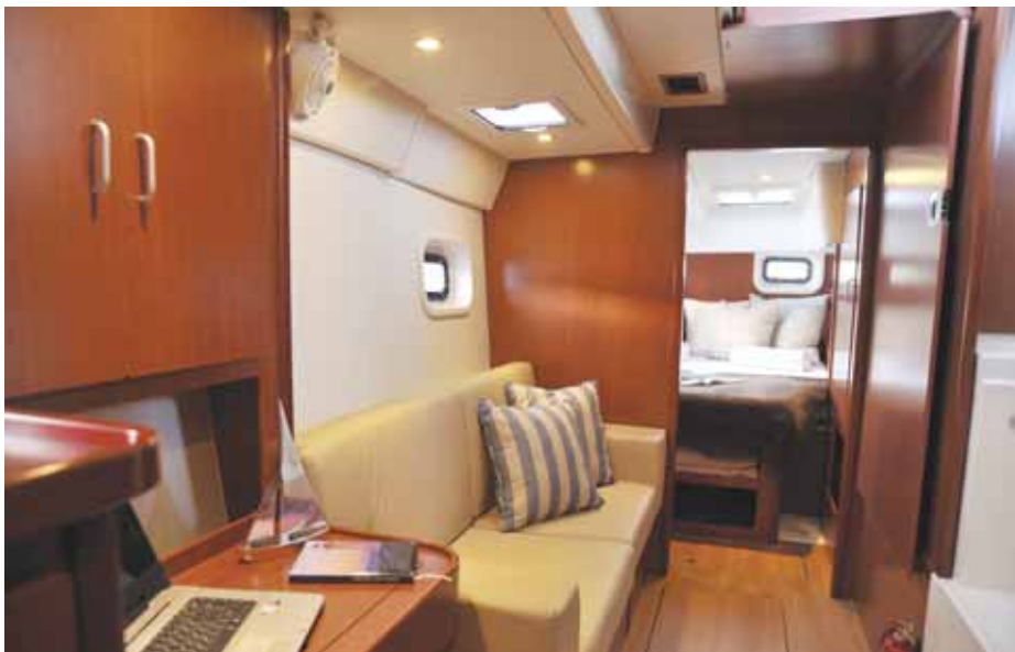
Looking forward toward the bows from the light, airy saloon. (top)